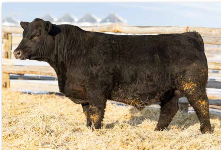
RYMO HOMELAND REVENUE 508L Sells as Lot 158.