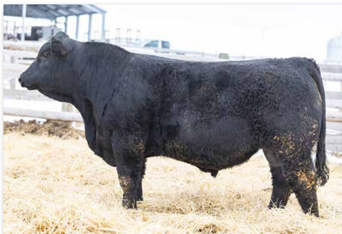
RYMO HONOR STONE 029L Sells as Lot 176.

Deep, balanced and has some extra round and carries down deep in the lower quarter. He has a little less CE than 175 but lots of everything else in the EPD department. His dam has been a producer with 7 calves at a 362 CI and 109 WW, 107 YW, and 103 REA ratios.