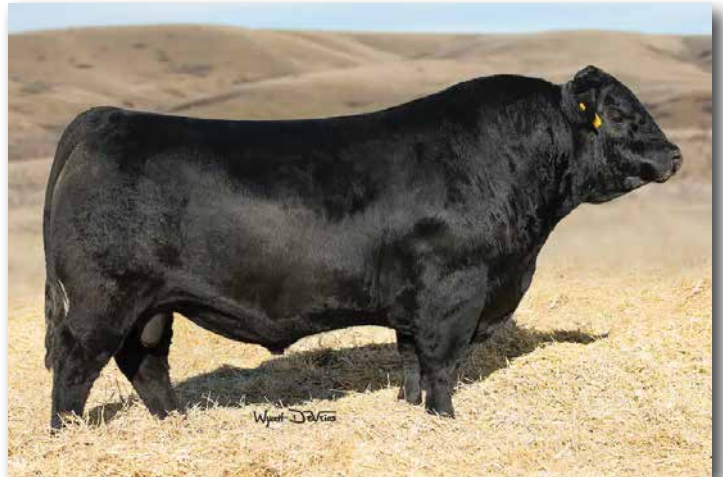
EGL GREAT WESTERN 87G Sire of Lots 1-3.

Stylish and attractive from end to end, L71 is a G+ ACE that does so much right. The D69 progeny all have great feet and are free and athletic in their movement. There is tremendous maternal strength here with a top 10% CE, 3% BW, 15% MCE and 10% STAY.