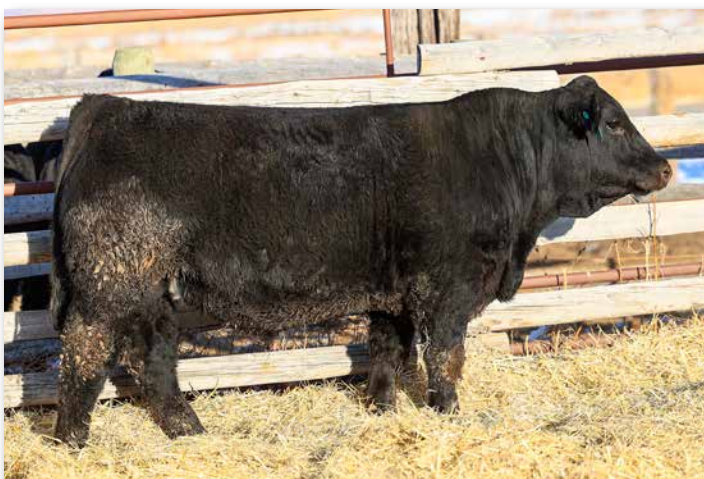
JJK L364 GEN TEN Sells as Lot 59.

Another attractive Frontline son. Comes from nice framed 4-year cow.