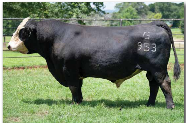
C-3 GROUND BREAKER NS G953 Sire of Lots 80-83.

Lot 81 is the low birth weight bull that comes with tons of potential.