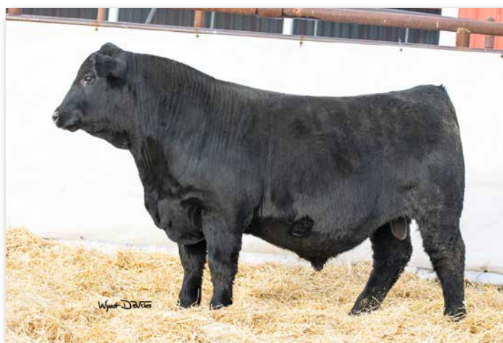
GW WINDFALL 285J Sire of Lot 167.

W98L should be the first GW Windfall offered this season. He comes with the ATM credentials. He is growthy and deep. He comes with a little more frame but has lots of hind quarter muscle.