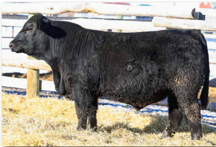
RYMO HIGHBRED BOUNTY 173L Sells as Lot 216.