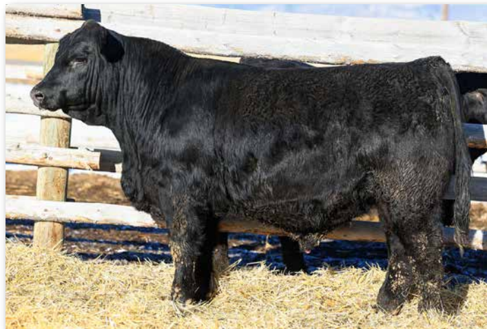
RYMO NATIONAL HERO K55L Sells as Lot 146.