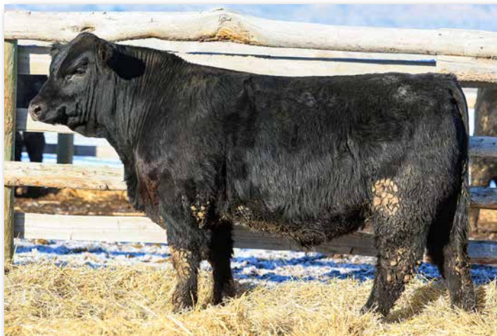
FAUTH MR HARTLAND 310L Sells as Lot 89.