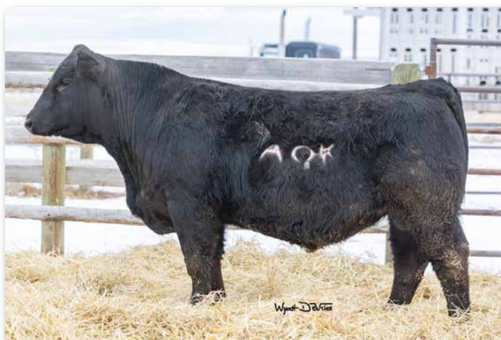
AOK LEGEND 152L Sells as Lot 27.

A solid Hardcore son with super growth. Check him out!