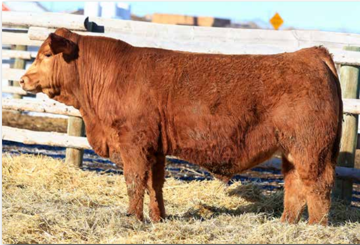
ORANGE JULIUS 369L Sells as Lot 243.

242-244 are the first set of WS Julius calves on the ground. They start light and then take off. Lot 242 has a no holes line up of EPDs. He is a red blaze face with a deep factor of x2. Super rib shape and design.