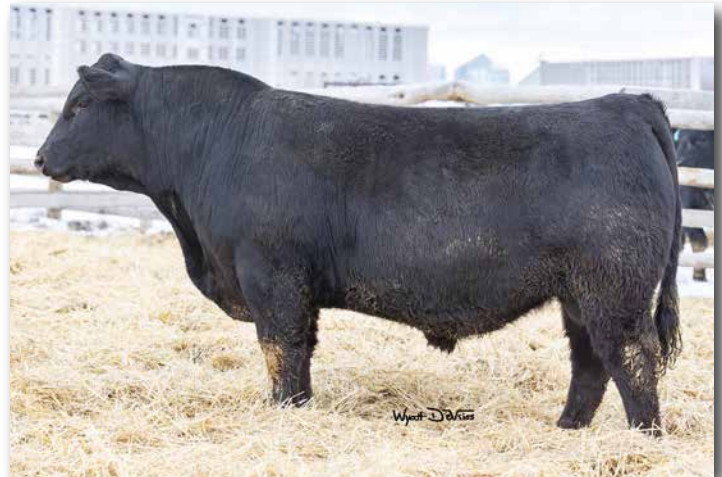
RYMO HOMELAND ADMIRAL 559L Sells as Lot 156.

156 will grab your eye every time in the pen. Maybe its because he has a great disposition but he is a pretty powerful bull to look at as well. Balanced numbers across with highlights of growth and carcass. This calf has no holes. Dam has 103 WW ratio on 3 calves and is one of the quietest you will find.