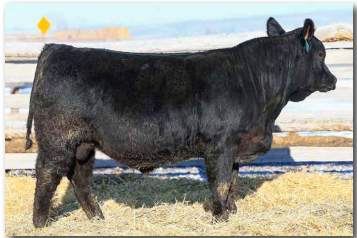
AOK LONGEVITY 142L Sells as Lot 33.

Use 142L on your heifers or cows! Excellent growth and super numbers with and API of 170 and TI of 101.