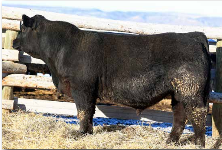
DMS GROUND POINT H30L Sells as Lot 143.