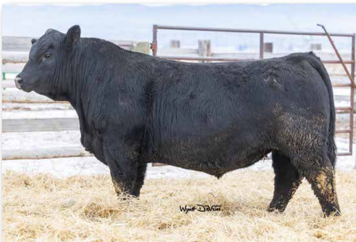
FAUTH BROWN EAGLE K22 Sells as Lot 101

Lot 100 is a dark red classy bull by ES Statement GZ33. Real nice purebred ready to work.