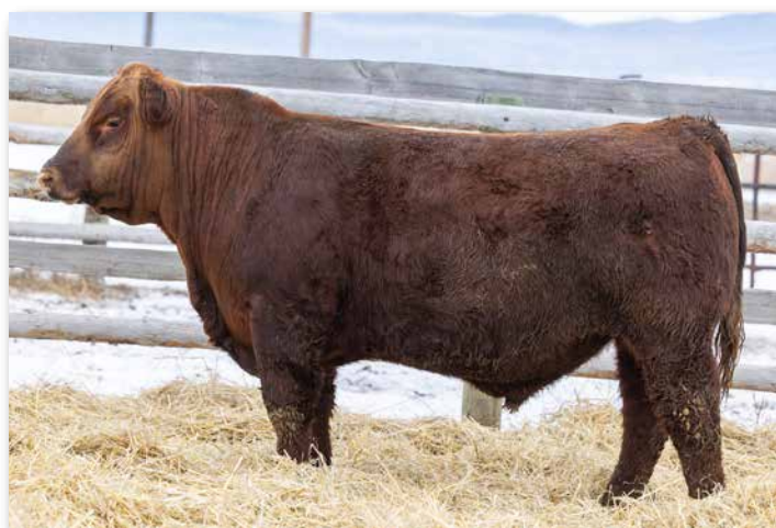
MFSR HOMETOWN 500L Sells as Lot 137.

1/2 Red Angus, that will put pounds on any offspring. This calf is well mated to get these results. He was a little off on the first half of the test but healed up and made a great come back the second half of the test. Look for him at the sale. Moderate with heavy muscling.