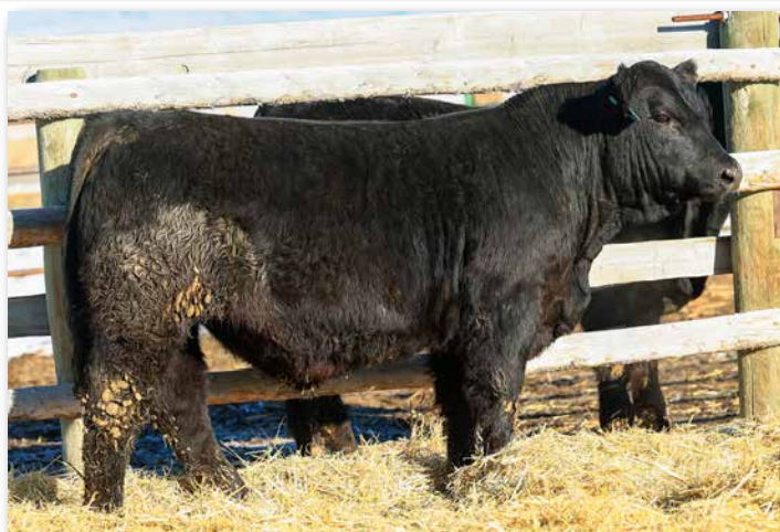
AOK LIFELINE 155L Sells as Lot 25.

Lot 25 has good growth and is in the top 2% for STAY. Out of a good Baltic dam.