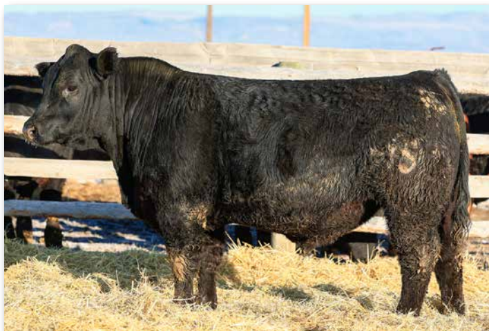
MFSR ECLIPTIC 850L Sells as Lot 115.

Great growth, stay, and docility which are all financially important traits.