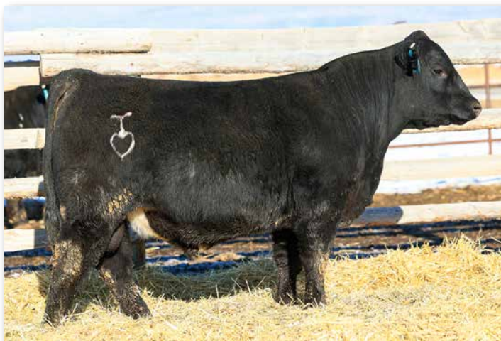
RYMO ORIGINAL FRANCHISE 255LK Sells as Lot 168.