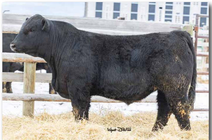
LBRS LANDO L35 Sells as Lot 3.

The powerhouse of the flush with tremendous length, muscle and structural integrity. His EPD profile reads similar to Genesis with top 15% WW, 10% YW and a carcass EPD set that when put into the ASA database yields only 3 bulls in the entire breed with these carcass numbers.