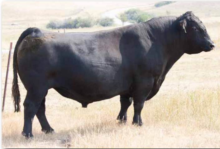
SOUTHERN FORTUNE TELLER Sire of Lot 196.