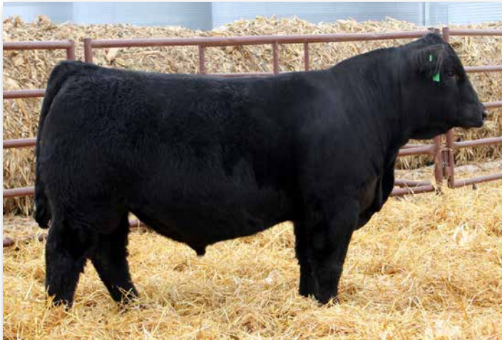
ES STATEMENT GZ33 Sire of Lot 100.

Lot 99 is by the great HSF Cardinal 133G, pretty made red baldy. Very quiet, moderate framed.