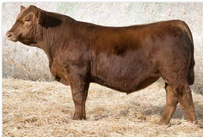
CLRS JEFFERSON 951J Sire of Lot 164.