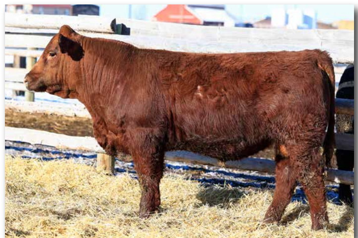
AOK LEVEL UP 104L Sells as Lot 43.

We really like our Hilger Ones. Lots to appreciate with this guy and his 77 lb. birth weight and G+ accreditation, so you can't go wrong.