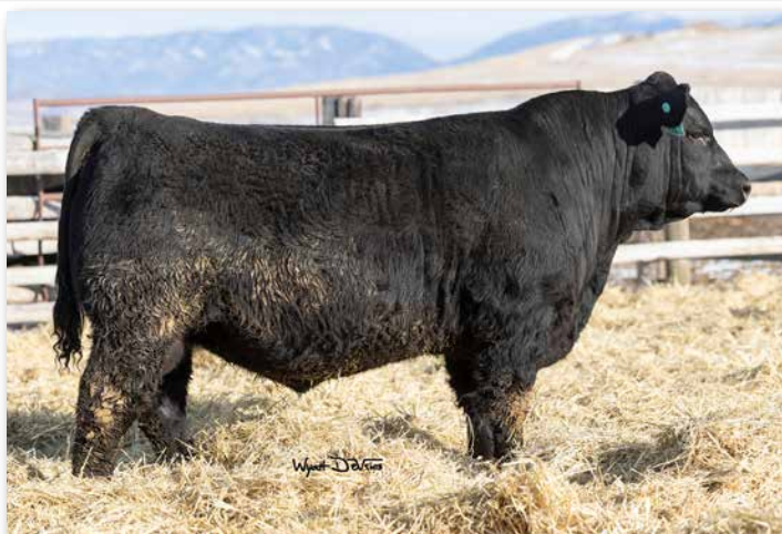
JJK L311 PAY DIRT Sells as Lot 51.