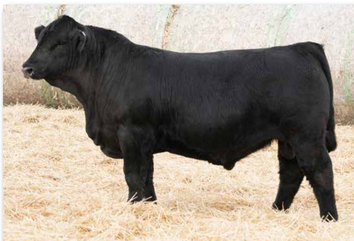
CLRS JOHNNY WALKER 1049J Sire of Lots 77 &amp; 79.

Nice Guardian son, by another 1st calf Teardrop daughter. Weaned off at 756 lbs. Not bad at all.