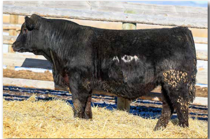
AOK LUCRATIVE 143L Sells as Lot 34.

Lot 34 is the super stout Homeland son out a good Beacon cow that you have been looking for. Top 1% REA.