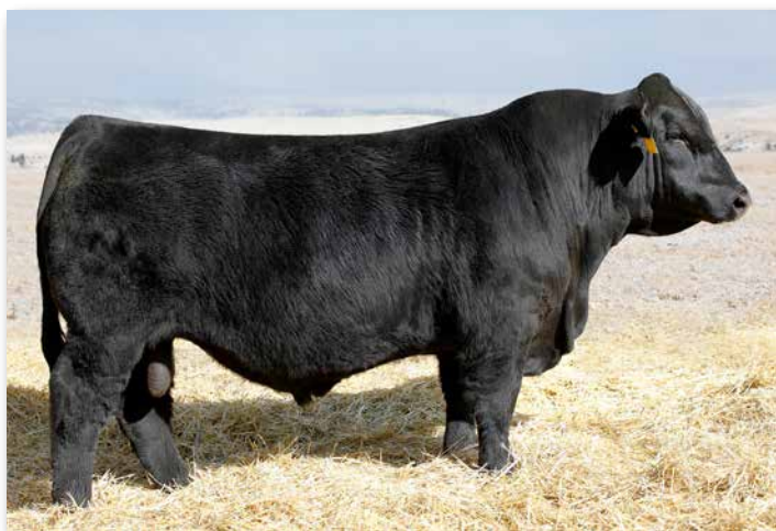
KBHR HONOR H060 Sire of Lots 126 &amp; 127.

Lot 125 is loaded with CE. This High Plains son has balanced numbers, is G+ certified and ranks in the top 15% API.