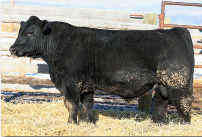
ES LJ131 Sells as Lot 65.

Lot 64 is a well made Honor son, with a low birth weight and strong weaning weight.