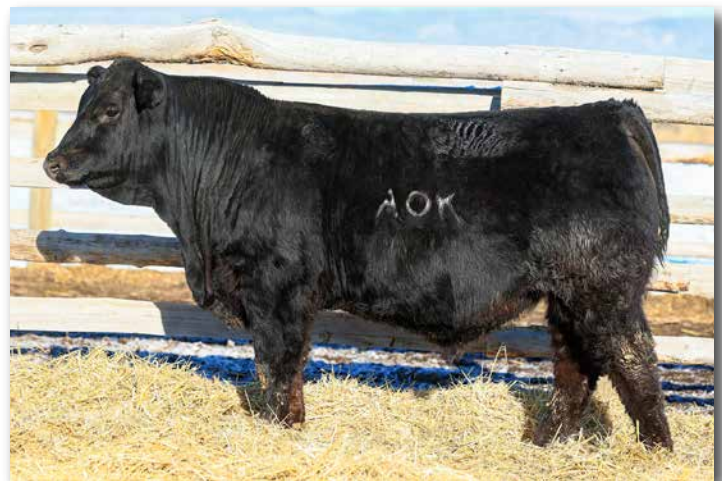
AOK LANDMARK 128L Sells as Lot 35.

Here is another really good Eclipse son that is square made and thick. Ready to add pounds to your herd.