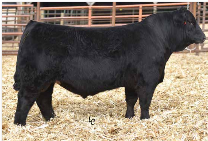
HOOK'S BALTIC 17B Sire of Lot 135.

The only Baltic son of the sale. He is heterozygous black and a twin but don't hold that against him. He has plenty to offer with his moderate frame and extra muscle. He comes from a great Superior cow and has lots of options for you.