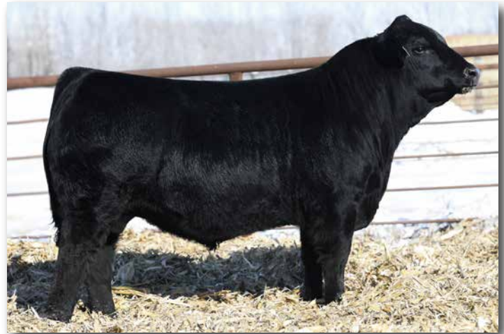
KRJ HZN DIRECT IMPACT F805 Sire of Lots 7-8.

Physically, L376 is very similar to his brother. He should produce calves with a lot of growth and replacement females that will excel for maternal strength and longevity.