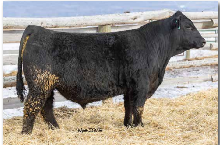
PLR LOGISTIC 306L Sells as Lot 20.

Thick, deep bodied grandson of our lead dam, Haylee. He carries a great set of EPDs. API top 15%, Marbling & TI in the top 10%. Out of a first calf, Stone Cold heifer with tons of promise.