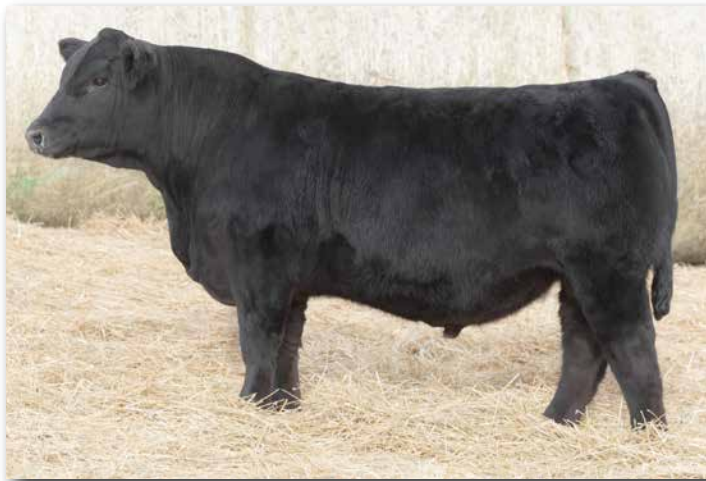
CLRS HOMELAND 327H Sire of Lot 151.