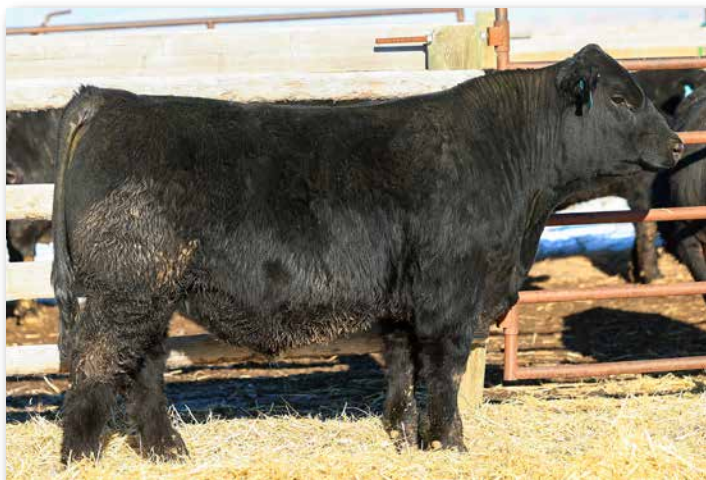
PLR LEGACY 288L Sells as Lot 22.