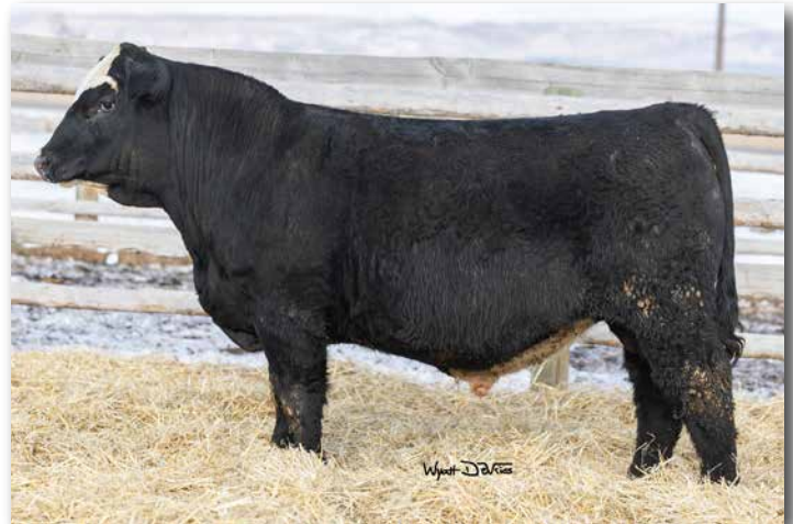
FAUTH ICE BREAKER 404L Sells as Lot 80.

Come see this outstanding blaze face, Ground Breaker son. He has 9 traits in the top 10% of the breed, out of a beautiful Frontline dam. Sure to make more just like her.