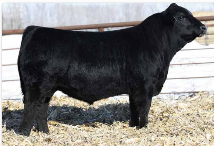
KRJ HZN DIRECT IMPACT F805 Sire of Lot 36.