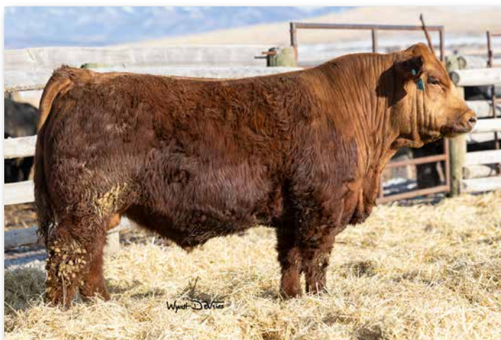
MFSR MAJOR MOVE 351L Sells as Lot 140.

The Major Move bulls have always been some of my favorites and the females are big, bold and powerful. Lot 139 might be one of the best.