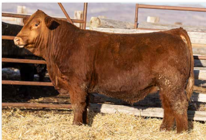
RYMO CARDINAL MAVERICK D85L Sells as Lot 236.

The HSF Cardinals have been well received around the country. Lot 235 is strong on CE, ranking in the top 2% and API in the top 20%. Out of a solid cow with a beautiful udder.