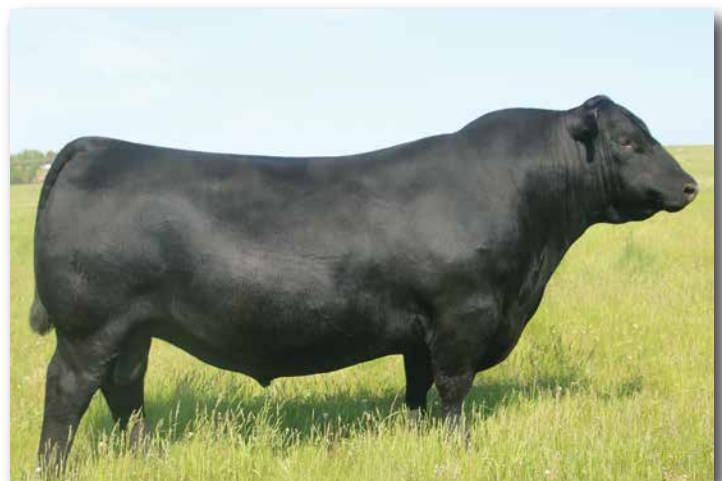
S A V RAINFALL 6846 Sire of Lot 104.

Rain Dancer is a unique 1/2 blood, age advantage bull. Extremely long, and thick. 8 traits in top 10% of breed.