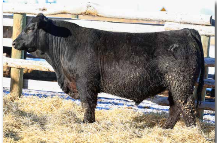
RYMO FORTUNE PROSPECT 225LK Sells as Lot 194.