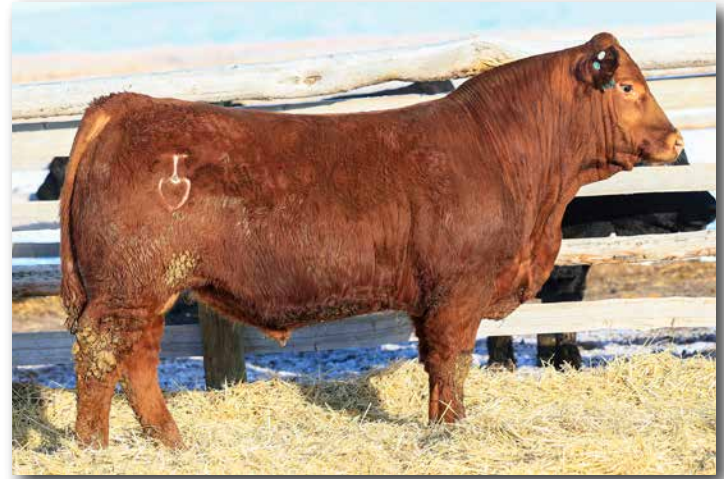
RYMO HILGER MAKER M63L Sells as Lot 230.