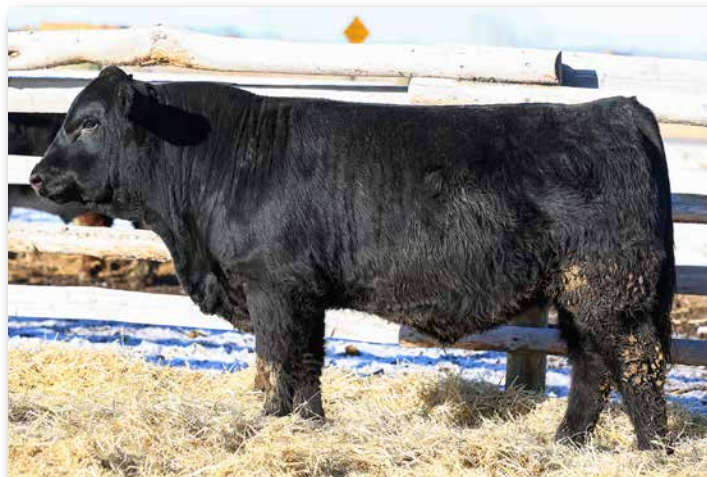
RYMO HERO CLUB K541L Sells as Lot 147.