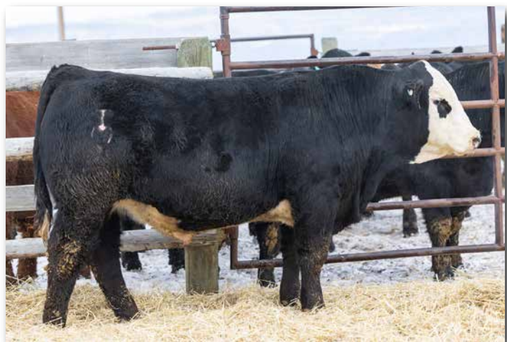
RYMO BOUNTY START G76L Sells as Lot 187.

Goggle eyes, deep bodied and near perfect numbers. His ATM logo will only help your bank account.