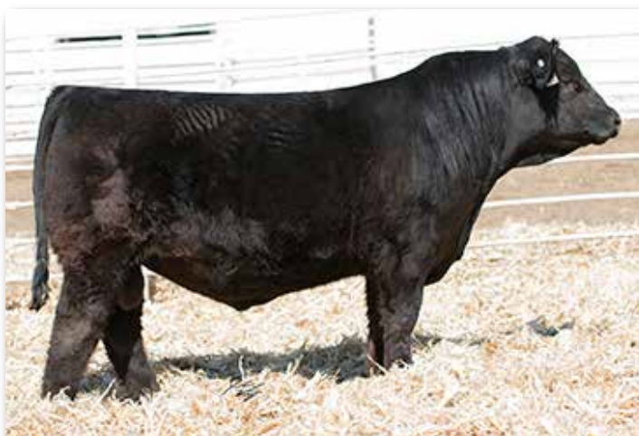
TJ HIGH PLAINS 986E Sire of Lot 125.