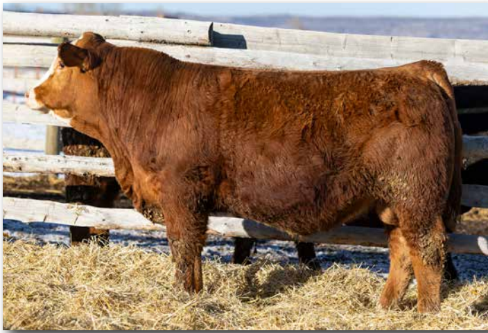
FAUTH RED ROCK 377L Sells as Lot 99.