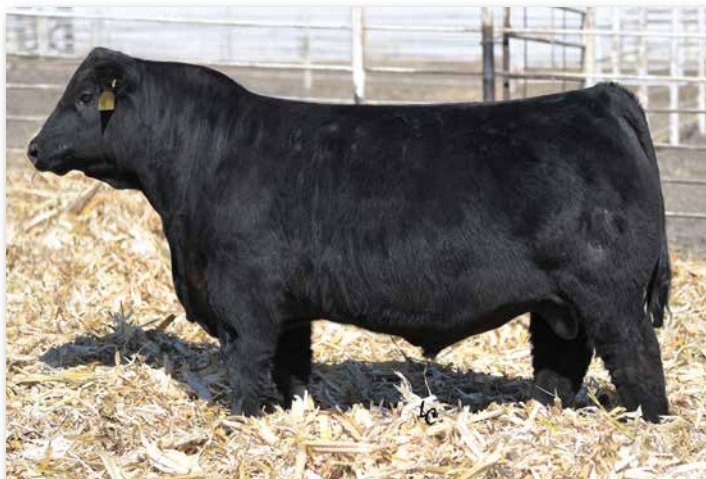
KBHR BOLD RULER H152 Sire of Lots 4-5.

D69's natural calf by Bold Ruler that has risen to the top since going on test gaining 4 pounds/day. This is very typical of her progeny, they simply have the ability to pack on the pounds. This is a great opportunity to tap into the D69 line in a calving ease package.