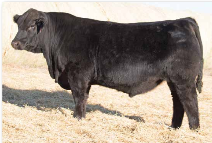
CLRS HERDBOOK 316H Sire of Lot 60.

Lot 60 is a well balanced, blaze face, 1/2 blood bull, with a 65 lb. actual birth and weaned off at 771 lbs. Gentle and ready to work.