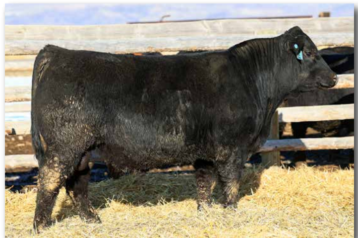
PLR LAWMAN 242L Sells as Lot 21.

A RightChoice score of 5, G+, ACE certified and out of a super deep bodied, extra thick Hoover Dam cow. A go to calving ease bull with eye appeal and growth.