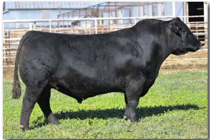
CCR COMMANDER 5135F Sire of Lot 47.

Commander son that ranks in the top 1% Stay and 10% API. Long and smooth bull with a gentle demeanor.