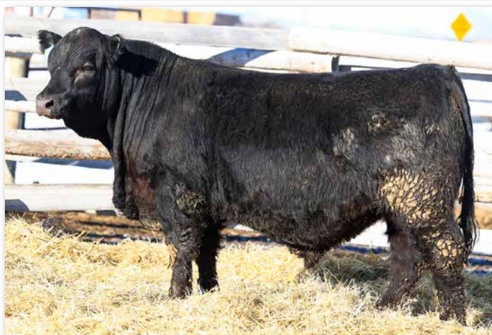
LBRS LAMAR L117 Sells as Lot 17.