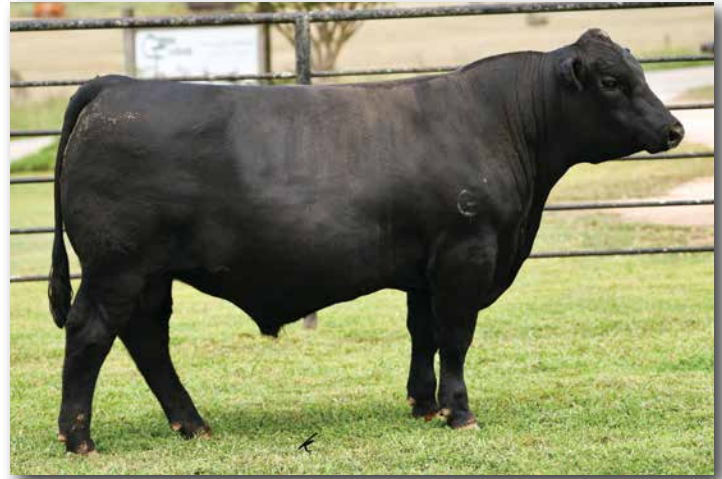
GIBBS 9114G ESSENTIAL Sire of Lot 40.

This Essential son has it all. Calving ease and growth lands him with an 177 API and 104 TI. Can't go wrong with this one.