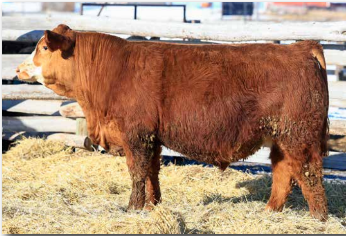
PEBBLE STATEMENT 333L Sells as Lot 242.