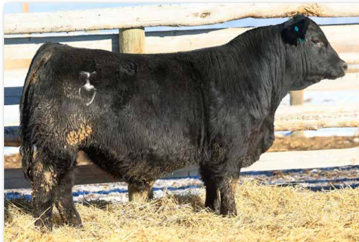
RICES PEPPERED FORTUNE H27L Sells as Lot 201.