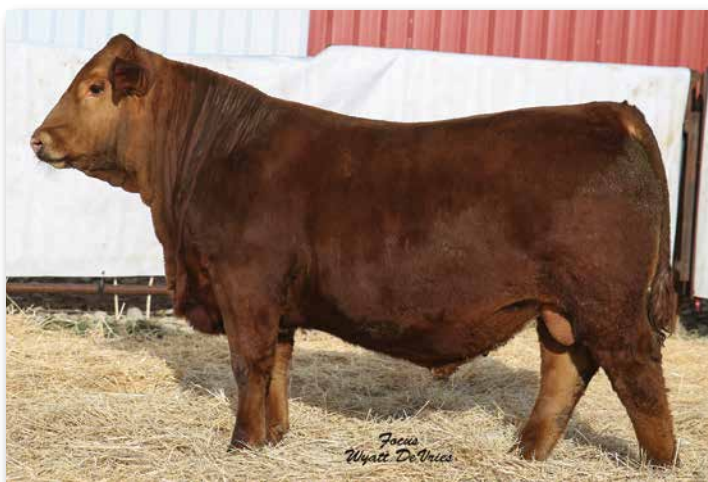
GW MAJOR MOVE 590E Sire of Lot 139.

Hometowns have been impressive calves and lot 138 is on that list. Lots of growth and ATM accredited.