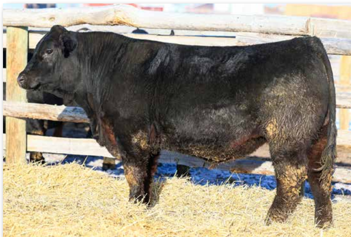
PLR LINCOLN 253L Sells as Lot 23.

A RightChoice certified 5, G+, & ATM. EPD pkg top 3% DOC, 5% Marb, 10% YR, API & TI. Top 20% WW. Dam was the 2021 Western Regional Classic Champion percentage Heifer. An all-around purebred bull with lots of eye appeal.