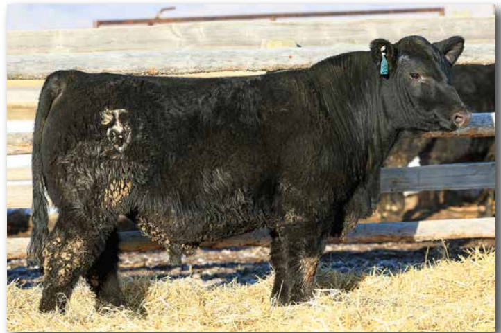
RYMO BETTER HOMELAND 544L Sells as Lot 155.

Lot 155 is pretty cool with his balance, style and free travel. He has good numbers that just keep getting better: top 10% WW 5% YW, 4% AGR, 3% YG, and 1% REA.