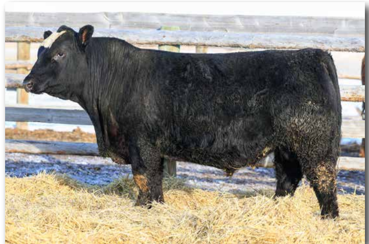
LBRS LEGEND L12 Sells as Lot 9.

A white faced Bold Ruler son that has been a stand out from the start. Structurally he is very correct and complete in his makeup and has a really balanced set of EPDs to complete the package.