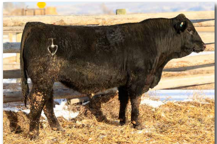
RYMO FORTUNE ROVER H67L Sells as Lot 195.

This black white face has goggle eyes and is deep with a big rib. Solid growth numbers and a great disposition will grab your attention.