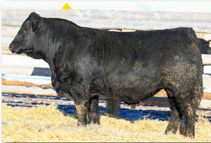
DMS HONOR FLIGHT 047L Sells as Lot 178.