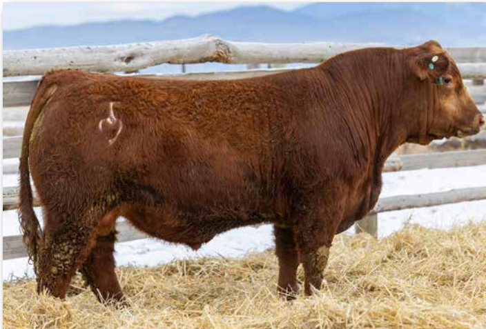
RYMO REDWOOD HILGER M75L Sells as Lot 228.

The Hilger One calves are deep red and have a lot to them. They are very growth and carcass oriented to get your calves where they need to be and make you $. Lot 227 is loaded with CE, low BW, and STAY out of a nice first calf heifer. He is thick and good.