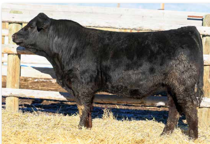
JJK L323 GENESIS Sells as Lot 53.

Very solid and powerful Masterpiece son. Top 10% CE.