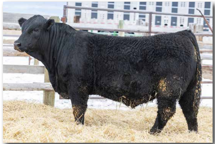
LBRS LATTIGO L32 Sells as Lot 7.

L32 is the first of two brothers out of the Miss Kayla 250D flush. We chose to flush this cow because of her tremendous maternal value. We have a number of her daughters already producing and are continuously impressed. This calf has both length and depth and all the muscle to go with it.