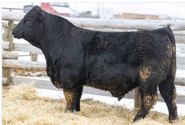
LBRS LAKOTA L517 Sells as Lot 15.

Here's an Innovate son with more frame and tons of depth and thickness. He is really sound made and athletic in his movement. His dam has one of the best dispositions of any cow we have raised. Look to this bull to add extra pounds and a great look to his calves. He ratioed 104 for WW.