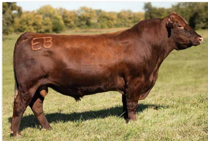
GW HILGER ONE 454H Sire of Lot 136.

Hilger Ones are dark red and ready to go. They will be a huge asset to your red herd.