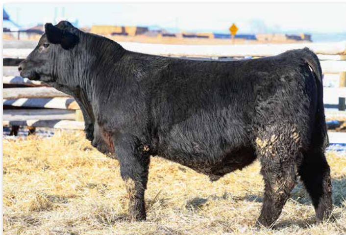
MFSR BIG SKY 030L Sells as Lot 106.