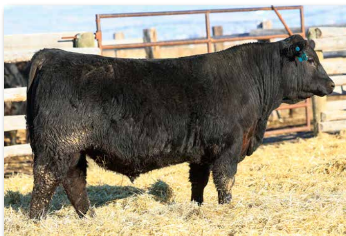
LBRS LAREDO L20 Sells as Lot 16.

A deep ribbed Innovate son showing great growth numbers. His dam is a Franchise daughter that goes back to the Kayla donor. She boasts ratios of 97 BW, 104 WW and 106 YW and this bull should produce progeny that follow suit.