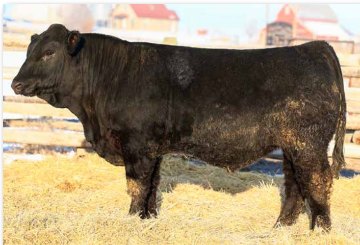
MFSR GENESIS 676L Sells as Lot 124.