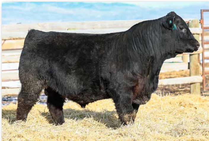
LBRS LINCOLN L206 Sells as Lot 11.