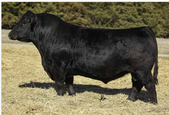
CLRS GUARDIAN 317G Sire of Lots 29-30.