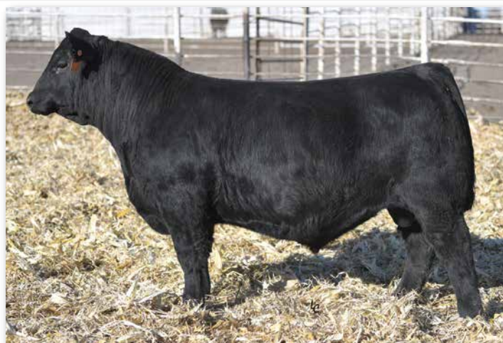
TJ INNOVATE 490H Sire of Lots 14-16.

This is a little younger bull, but he doesn't give up anything with his growth numbers. A bull with a little more get up and go that should be able to cover some country when he matures out.