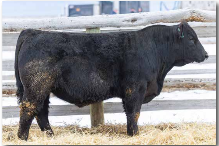
LBRS LIBERTY L56 Sells as Lot 1.

L56 leads off the flush out of Diana D69, dam to LBRS Genesis. Diana's progeny, like Genesis will add value in every aspect, great feet, structure, growth, exceptional carcass merit and we are just starting to tap the maternal strengths behind this power house donor. L56 himself is a wide based, level topped bull with extra dimension and overall physical excellence that is hard to beat.