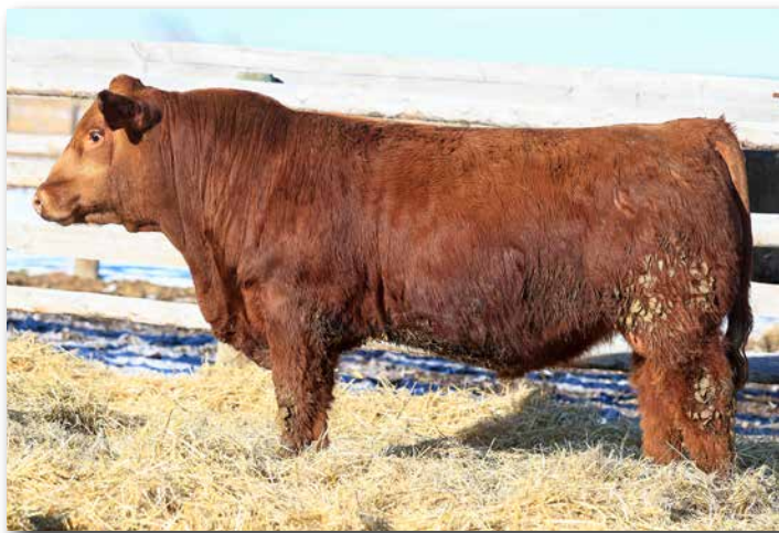
MFSR HILGER ONE 113L Sells as Lot 105.