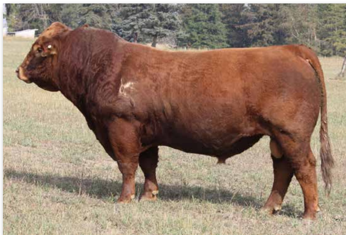
HSF CARDINAL 133G Sire of Lot 235.

Lot 234 has a little more frame than some of the reds but he is extra long to balance it out and he has the muscle to put it all together. Solid ratios at 110 WW and 104 YW. The Major Moves make some beautiful daughters and powerful bulls.