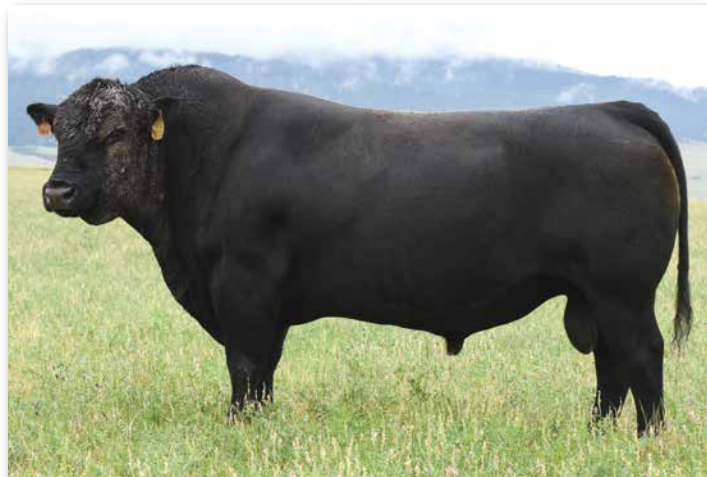
TFS DUE NORTH 2659Z Sire of Lot 110.