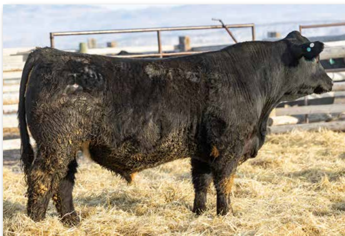
RYMO NEBRASKA POWER F73L Sells as Lot 171.

Lot 170 is made extra long with a little more frame and a beautiful hip. Lots of growth and maternal ranking in the top 10% WW, YW, and ADG. His dam has a 108 WW and YW ratio.