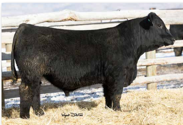
LBRS LOGAN L254 Sells as Lot 6.

A wide based, deep ribbed Bold Ruler that is truly impressive. This ACE certified calf is a heifer bull candidate that will do so much more. If you want more marbling, this guy will do it and you will want to keep the females, they will be good.