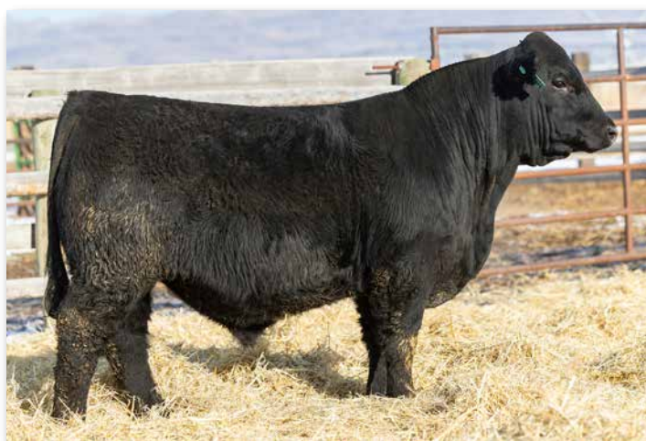
LBRS LANDER L70 Sells as Lot 13.

Stylish with a tremendously correct phenotype describe this Innovate son. He comes in a smaller package and is out of a moderate framed 10 year Axis daughter. Longevity is built into this calf and he boasts a top 10% stay number.