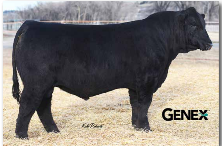
LBRS GENESIS G69 Sire of Lots 87 & 88.

Lot 87 is great Genesis calf. Clean made 1/2 blood with 6 traits in the top 10% of the breed. 805 actual weaning weight, straight off our short grass country.