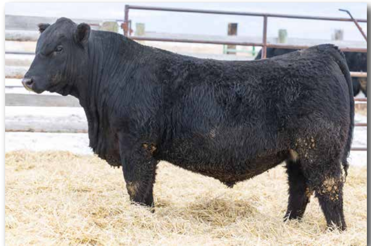
FAUTH OL MEDICINE 458L Sells as Lot 95.

95 out of Monte dam, sired by a Franchise son. Low birth weight bull, with excellent growth. Very quiet.