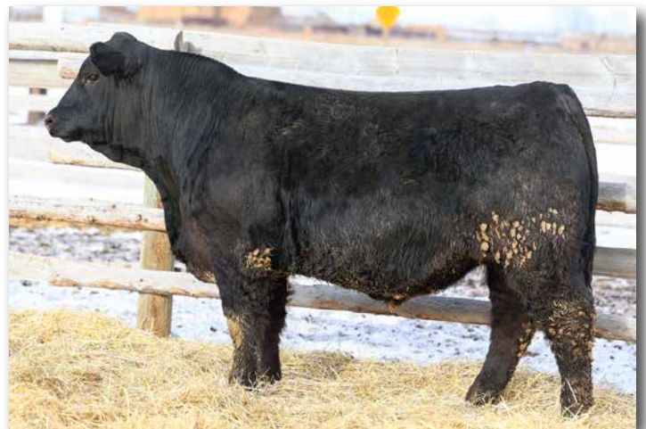
FAUTH MR GENESIS 353L Sells as Lot 88.

Look at this real nice, moderate Genesis son with a low birth weight. Ranks in top 10% for marbling.