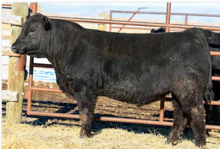
LBRS LONG RANGE L69 Sells as Lot 4.