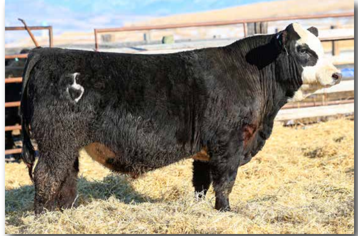
RYMO FORTUNE TARGET 222L Sells as Lot 193.