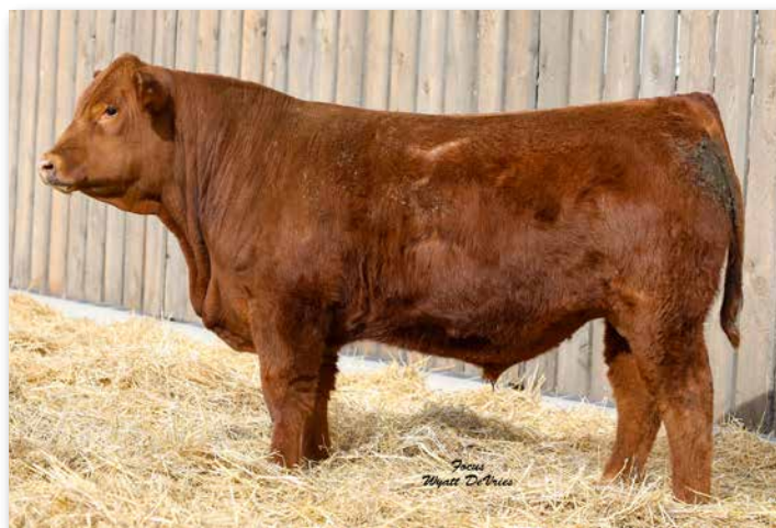
BRIDLE BIT RED ROCK G9124 Sire of Lot 130.

This Red Rock son is out of a 1st calf heifer from the Kunkel Simmental in ND. For being my youngest calf in sale, he is doing really good and only going to get better.