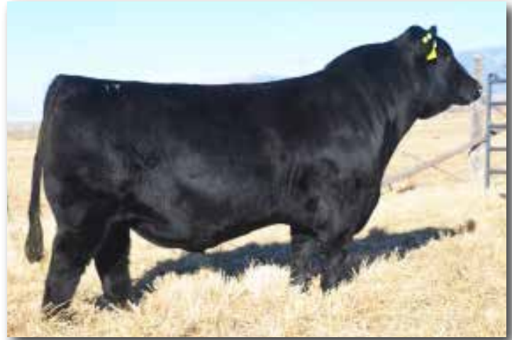
THSF LOVER BOY B33 Sire of Lots 19-20.

Thick, long bodied son out of our lead dam, Haylee. 8 calves with Ratios of BW-100, WW-109, YR-110, US-110, IMF-135, BF-118 and REA-102. She is the dam of LBRS Herd sire PLR Insight 227D. An outcross pedigree with exceptional phenotype.