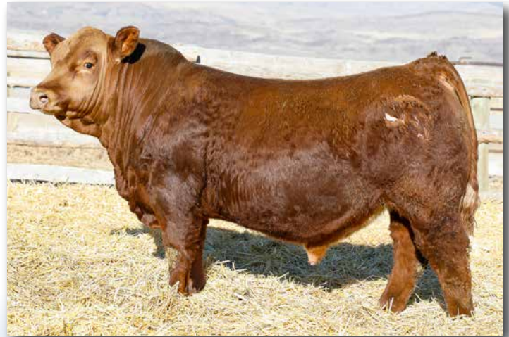
MFSR ROUNDUP 665H Sire of Lot 142.

The Roundup calves should continue to prove themselves, by adding the pounds to any program.