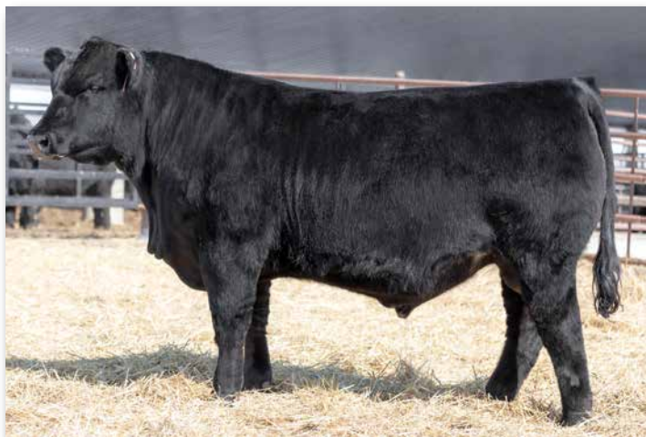
HOOK'S GALILEO 210G Sire of Lot 31.

Here is a gentle Guardian son that ranks in the top 3% of the breed for STAY.