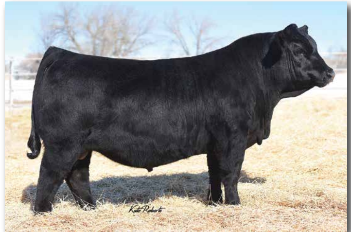
HOOK'S EAGLE 6E Sire of Lot 103.

Lot 103 is the third flush mate to 101 and 102. Correct in every way and age advantaged bull. True moderate bull that is easy on the eyes. Take 101, 102, and 103 and make some high end beautiful females.