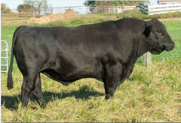
HOOK'S FRONTLINE 40F Sire of Lots 57 &amp; 58.