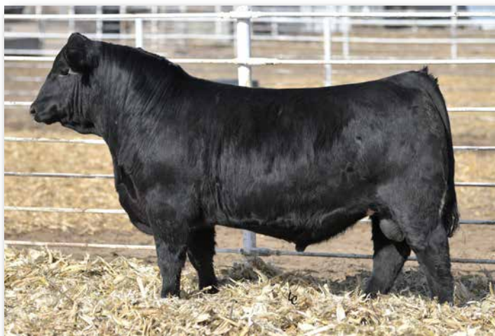
TJ NEBRASKA 258G Sire of Lot 207.