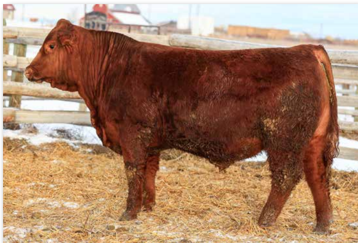
RYMO MAJOR CONQUEST M33L Sells as Lot 234.