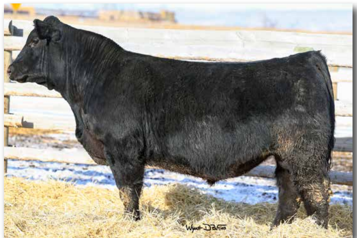
ES LJ100 Sells as Lot 71.

Here is a very classy Galileo son, from a first calf heifer. Sure footed, free traveling, many traits in top 10%.