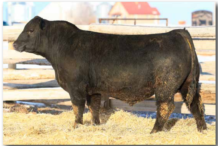
FAUTH EAGLE EYE K340 Sells as Lot 102.

Lot 102 (Eagle Eye) is a full brother to 101, and 103. He is my pick. When he walks in the pen, all heads turn. Come take a look, beautiful feet, just an awesome creature. So cleaned fronted yet masculine from front to back.