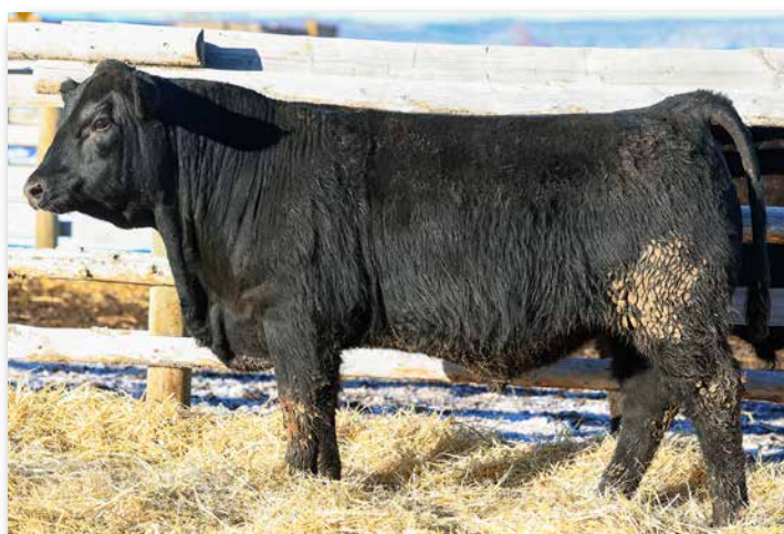
FAUTH MR INCENTIVE 301L Sells as Lot 85.

Lot 84 is by Sitz Incentive 704H. We used Incentive on both heifers and cows with great calving ease. Lot 84 has perfect feet like his sire. A great 1/2 blood prospect with low birth and good growth.