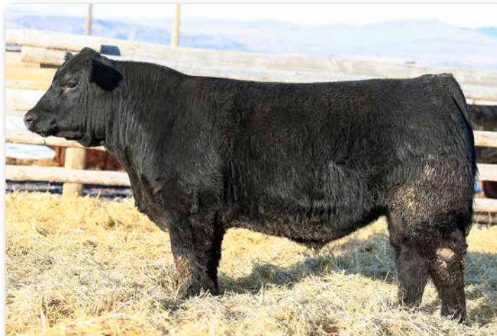
MFSR COWBOY CUT 868L Sells as Lot 109.