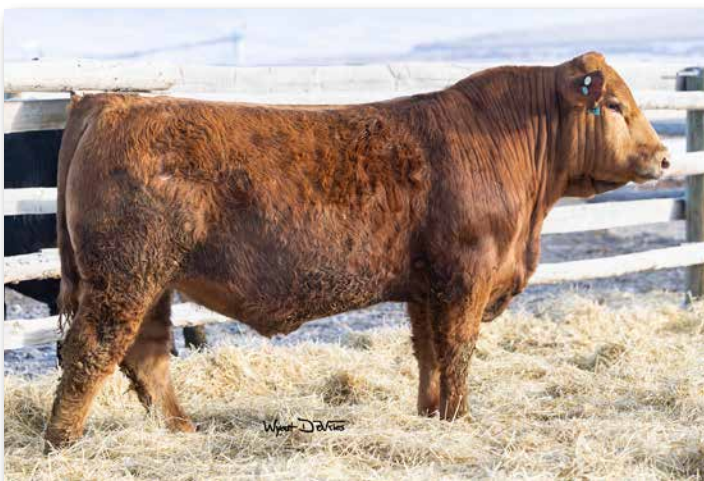
RYMO HILGET COMMOTION M47L Sells as Lot 229.

Extra, extra... this guy has extra muscle and width. I have several plus signs by him in my notes. He is a nice percentage bull with solid growth numbers and maternal traits. Comes from a super cow family.