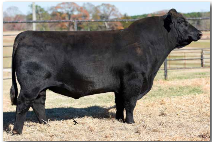
FSCR MOUNTAINEER G051 Sire of Lot 94.

Lot 94 is a real clean made 1/4 blood bull out of a good herd bull we have used on heifers and cows. Lot 94 is also from a 1st calf heifer and he has G+ accreditation.