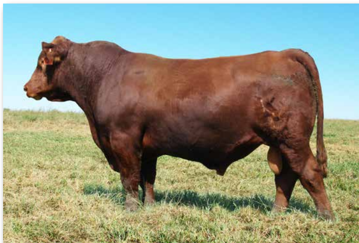
KCC EXCELLENCE 139-774 Sire of Lot 133.

A non-dilutor red Cardinal son that comes with a G+ accreditation.