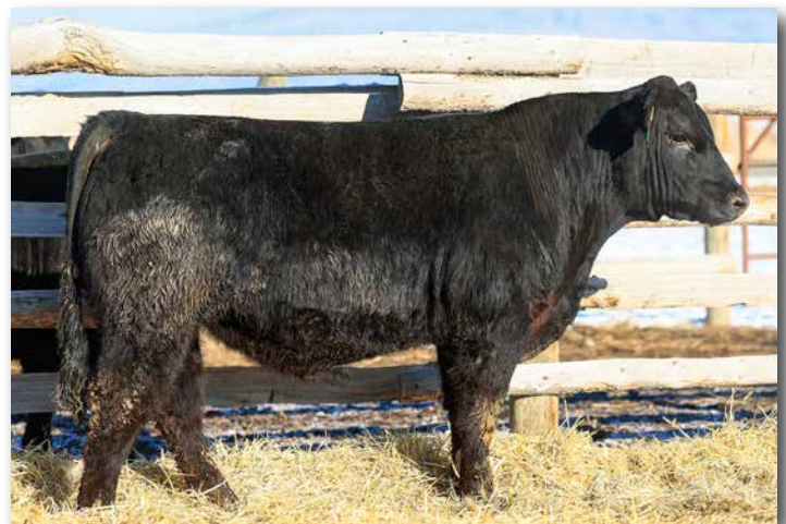
JJK L34A HOME LAND Sells as Lot 50.

Twin bull out of Homeland, tracts correctly and top 3% REA.