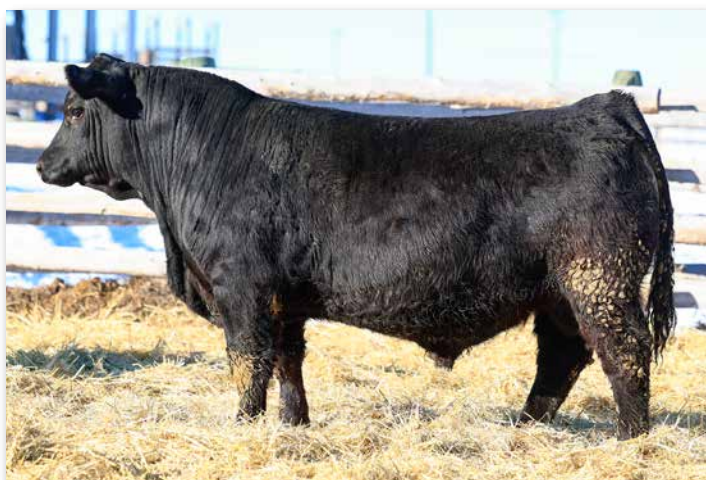
RYMO NEBRASKA POWER N28L Sells as Lot 208.

A Nebraska son that started at 60 lbs. and shot up to 760 for weaning. His dam has had 10 calves with a CI of 360 and 120 IMF and 117 BF ratios.