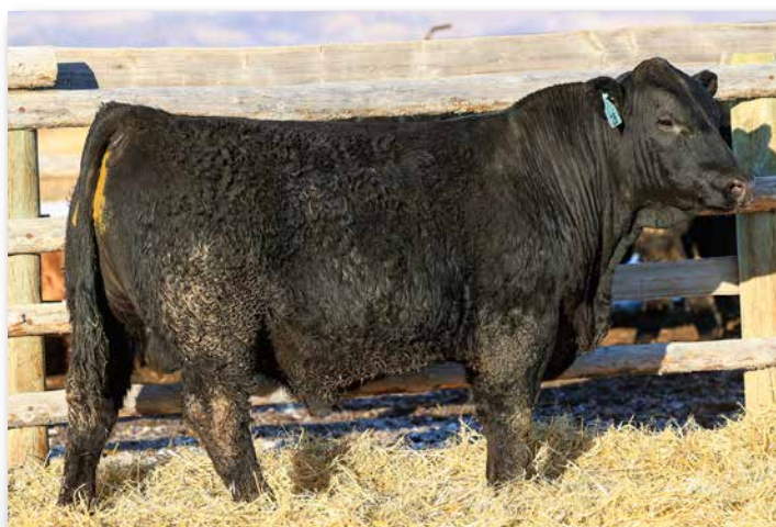
LBRS LEAGUE L37 Sells as Lot 18.

A great heifer bull prospect with growth as well. He weaned off at nearly 800 pounds off a first calf heifer and was the top gaining Innovate son on test at 4.06 pounds per day.