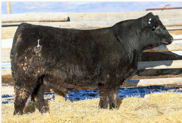
RYMO FLINT ROCK DREAM 959L Sells as Lot 144.

Nice way to start off with a C-3 Ground Breaker that has all the right pieces. Right Choice score of 5 and G+ logo. Extra deep, sound, and smooth made with loads of dimension and style. Bulls were fed for 3 lb. ADG but he over achieved at 4.47.